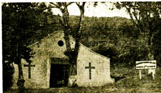
Nazarene Training College