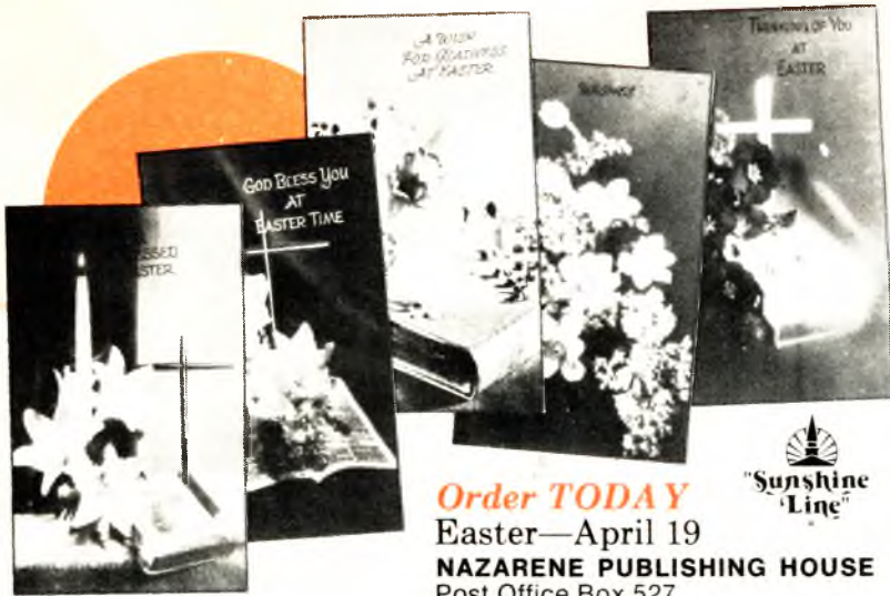
Prices subject to change without notice

G-7161 Boxful of 10 cards! . . . . . $2.00