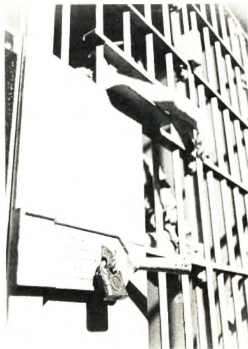
H. Armstrong Roberts

You can have sweet communion with God as a result of being "prayed up." That is a phrase I hope will catch on in your home and in your church. Be "prayed up" like a football team is "psyched up," like an orchestra is "tuned up," like an athlete is "keyed up" and ready to run the race, like the bride is "dressed up" and ready for the bridegroom. Be "prayed up" and enjoy sweet daily communion with God. □