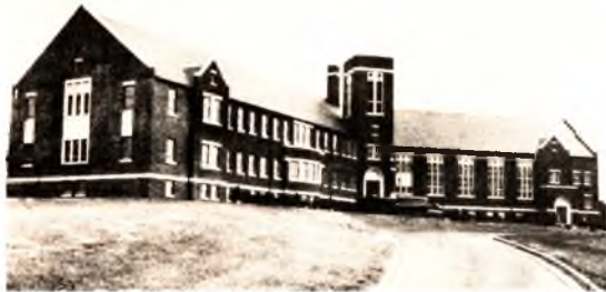
Nazarene Theological Seminary in Kansas City

... we must always keep in mind that the seminary was established and is maintained for the training of a ministry for holiness churches. . . . Our existence, our objectives, our plans, are all united in the purpose that . . . scholarship must be permeated by the divine presence , that each teacher must be a growing Christian, vital in personal fellowship with the Holy Spirit, committed to this uniqueness, and motivated by a sense of mission for God and the Church. The consciousness of the divine presence must control us as individuals until our faith and fellowship in God makes an impact deeper than intellectualism.