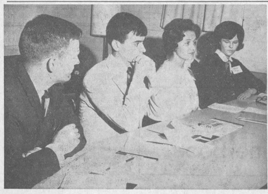
Four delegates listen intently to one of the speakers at an afternoon session of the Third Nazarene Student Leadership Conference.