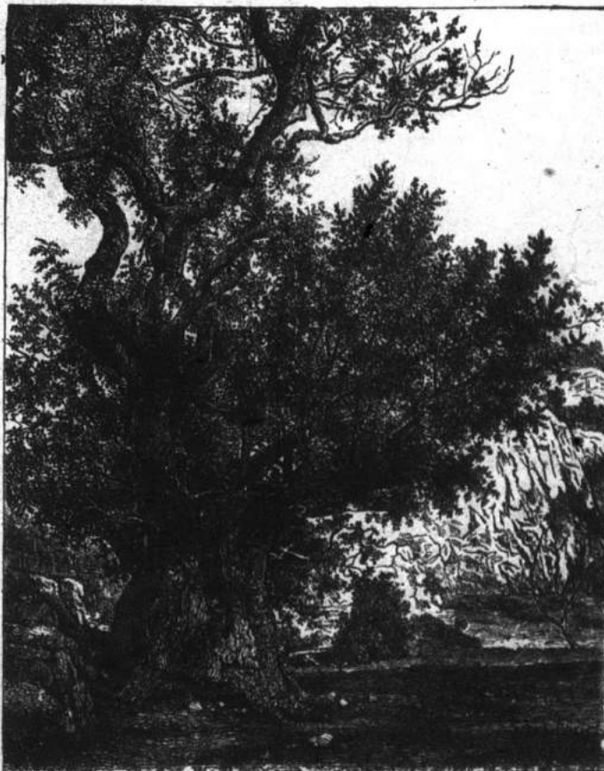
LOCUST TREE OF PALESTINE.

One wonders if the reason why we are forced to be satisfied with so little is because