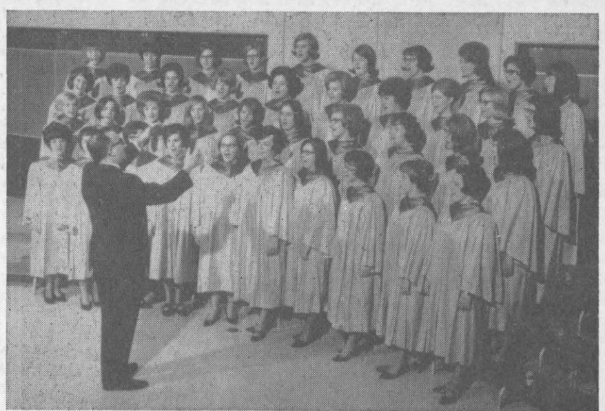
The Treble Clef choir will "sing for Trevecca" tomorrow night.

Trevecca hosts the Treble Clef Choir from Olivet Nazarene College tomorrow night in the McClurkan auditorium. The women's ensemble from Kankakee, Illinois will present a sacred concert at 8 o'clock.