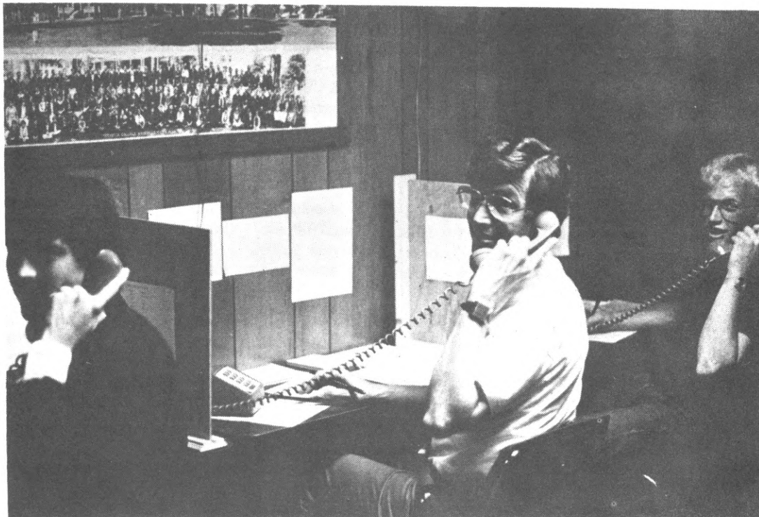
Phone-a-thoners pose for the camera at Phone-a-thon

The callers use color coded cards to separate the year's the alumni attended. Gold for 20's, 30's, 40's; Green for 50's; Cherry for 60's; Yellow for 70's; Blue for 80's and White for the misc. These cards are to help the caller keep things in order, keep track of who has given in the past, and who they have and haven't called. The callers are provided with refreshments each night to keep them going and T-shirts for their hard work. It takes a lot of time and effort on the callers part to make the Phone-a-thon a success.