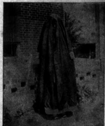
A KOREAN WOMAN.

At the end of two years' work there were nine communicants; at the end of ten years not yet 400 communicants; but, into whose few men God poured forth His Spirit, and