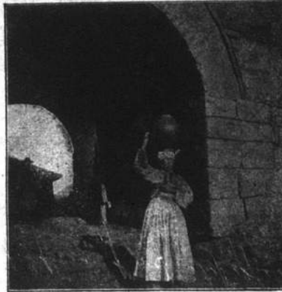
WATER CARRIER, KOREA.

Songdo, Fusan, TaiKu, Kongju, Pyeng Yang, and Syen Chun have numbered from 150 to 700, some of the women walking 200 miles in order to attend them. Classes for men and for women are arranged for, so far as possible, in every one of the more than 2,500 Churches or groups in the country. The attendance ranges from 5 to 500 in the coun-