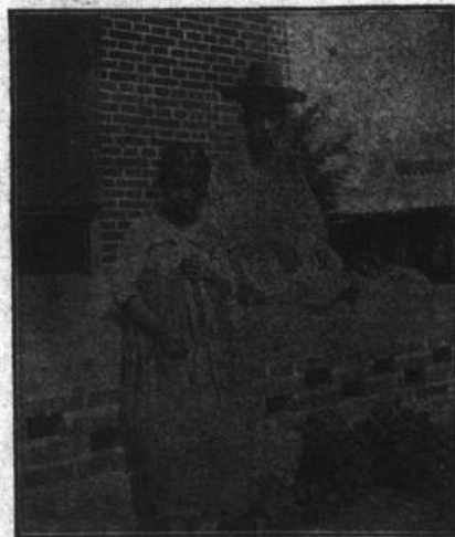
KOREAN MAN AND WOMAN.

Here it is that the Church has obtained its great spiritual power and appreciation of